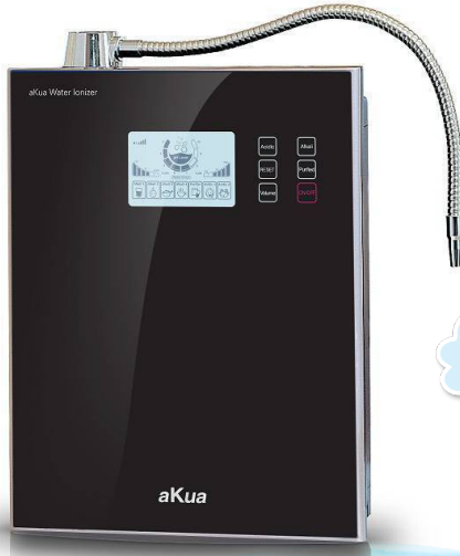
Overview of electrolysis process: